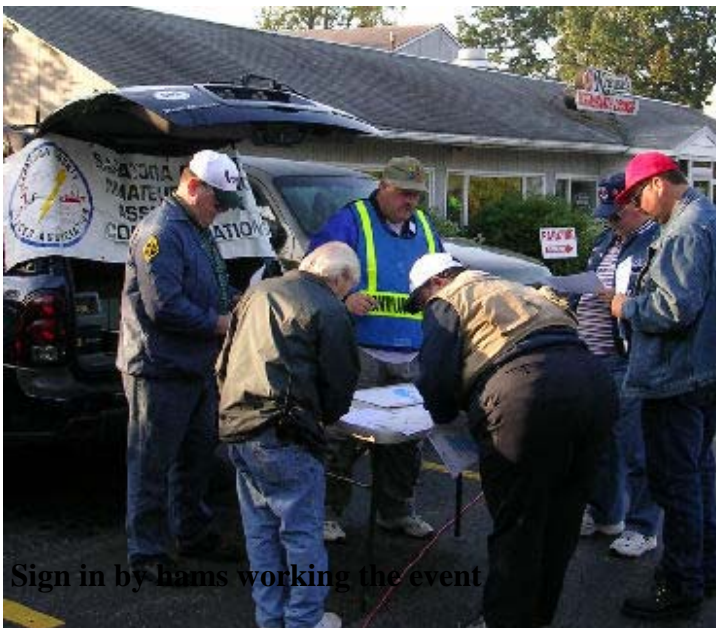
Sign in by hams working the event